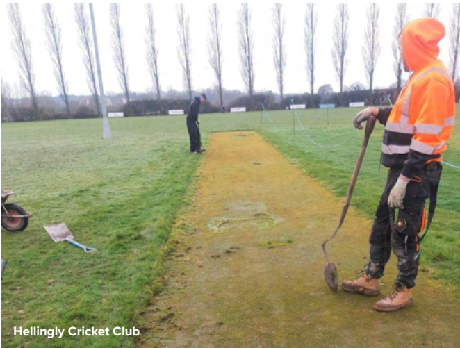
Hellingly Cricket Club