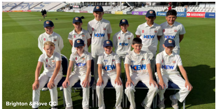
Brighton & Hove CC