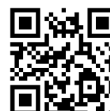
2022 DIScoverABILITY Day