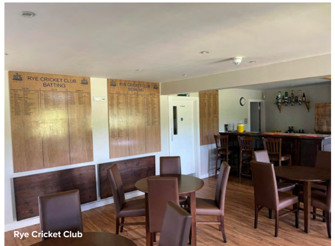
Rye Cricket Club