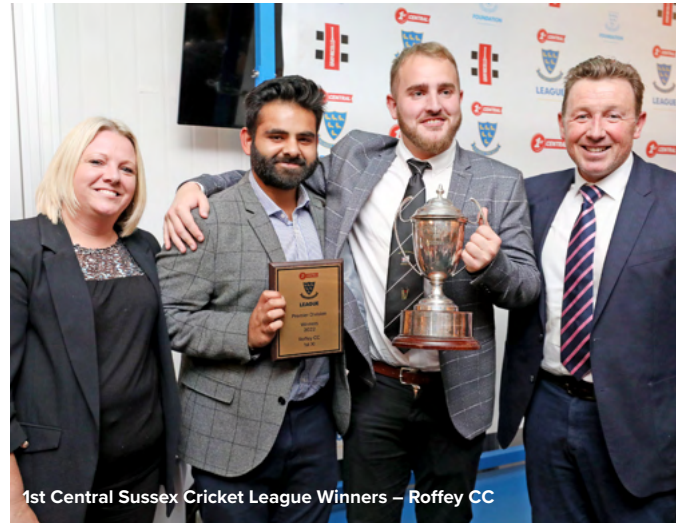
1st Central Sussex Cricket League Winners – Roffey CC