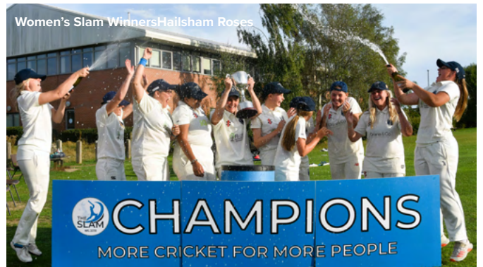
Women's Slam Winners Hailsham Roses