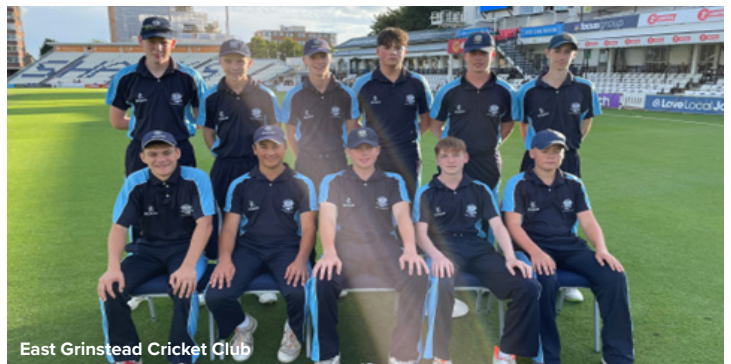
East Grinstead Cricket Club