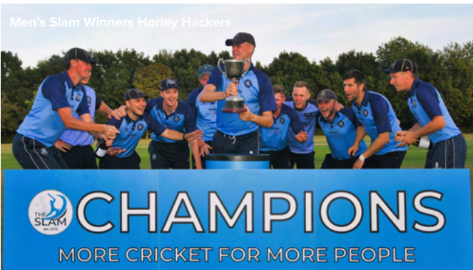
Men's Slam Winners Horley Hackers

WE HOPE TO PLAY OUR PART IN GROWING THE GAME AND ENCOURAGING OTHER TEAMS TO GET INVOLVED. THE LADIES/GIRLS HAVE STARTED TRAINING IN ORDER TO GO ALL OUT AND DEFEND THE TROPHY THEY SO RICHLY DESERVED IN 2022.”