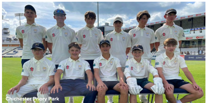
Chichester Priory Park